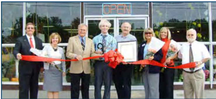
GIFT FROM THE HEART 573 South Main Street • Crossville, TN 38555 931-484-5520