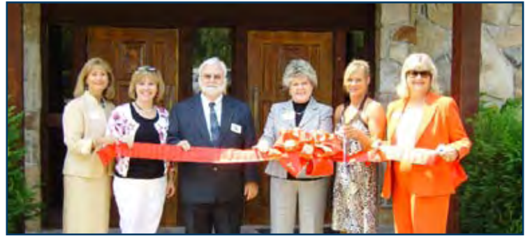
MITCH'S RESTAURANT & LOUNGE 103 Country Club Drive • Crossville, TN 38572 931-788-6717