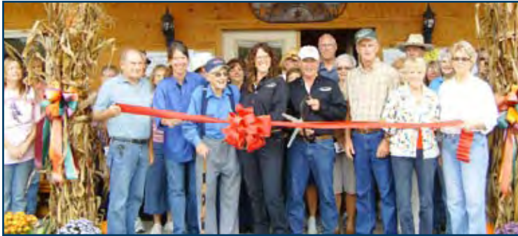
CATOOSA RIDGE STABLES & CAMPGROUND 2443 Todd Road • Crossville, TN 38571 931-397-7433