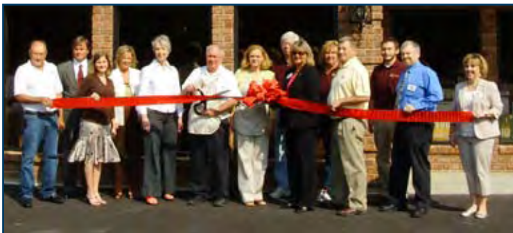
PEAVINE WINE & SPIRITS 745 Peavine Road • Crossville, TN 38571 931-484-2121